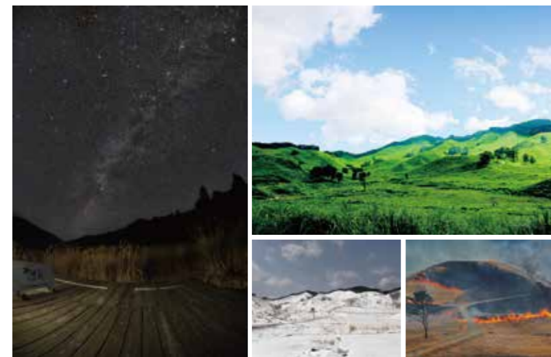
1: As summer sets in, a vast field of green susuki grass unfolds across the highlands. 2: Thanks its high altitude, the Tonomine Kogen Highlands offer a prime setting for astronomical observations with a vast star-filled sky. Visitors in autumn will be treated to a picturesque sight of the Milky Way over a field of golden susuki grass. 3: In winter, the highlands taken on a silver hue as the landscape is blanketed in snow. 4: Every year, the "Mountain-Burning Festival" is held to announce the arrival of spring at Tonomine Kogen Highlands. The festival sees the grasslands completely devoured by flames, ensuring beautiful future regrowth. With a different scene on display each season, visitors are sure to find new discoveries no matter what time of year they visit.