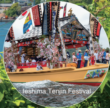
Ieshima Tenjin Festival